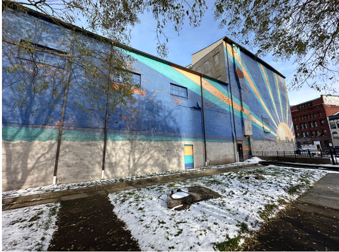
The artist or artist team is expected to paint the entirety of the wall. Due to the large scale of the building, it is imperative that the artist or artist team consider the scale of the different components of their mural in relation to the size of the individual and the surrounding environment, including the park's fountain and trees.