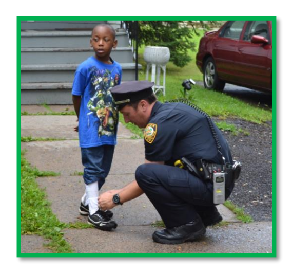
Quality of Life Sweeps

As a response to national incidents in 2015, the City of Utica and the Utica Police Department created a Community Outreach Division in 2016. The mission of the Community Outreach Team is to help bridge the gap between the police department and community members by developing and strengthening partnerships with community leaders, neighborhood watch groups, civic groups, schools, faith-based groups, businesses and public service agencies throughout the city. The unit is also responsible for passing on information regarding problem areas in the city or tips to other officers, as well as identifying nuisance properties and working with homeowners to address any quality-of-life issues. The team has grown to three people and has a host of activities that they are involved in.