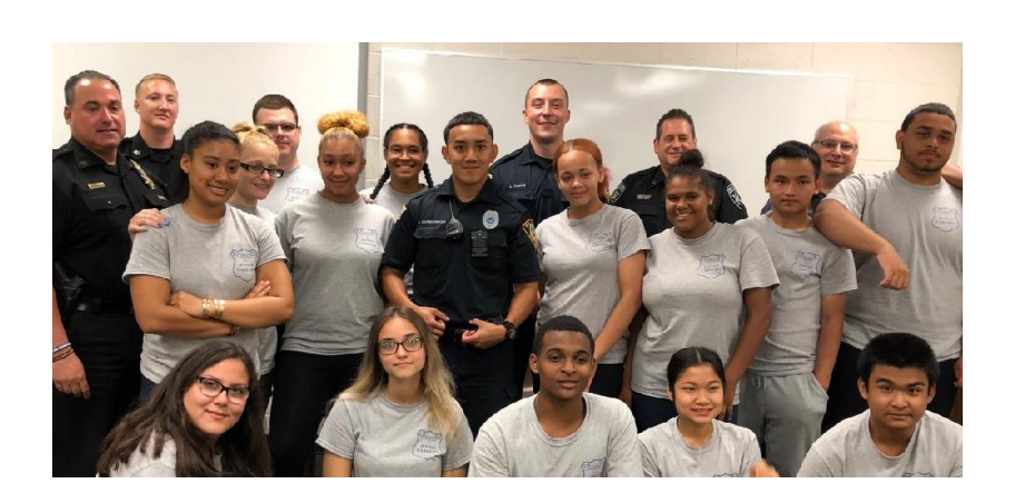
Pathways to Justice Careers