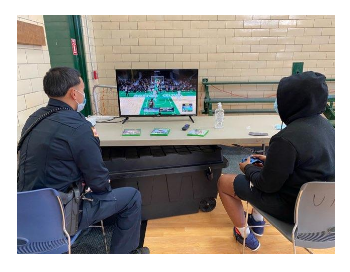
Police Community Athletic League

Juniors and Seniors in high school are recruited to take part in Pathways to Justice Careers. The program is designed to get young adults interested in careers in public safety, including the police department as they begin making career and post-secondary education choices. The program consists of academy-level training classes, volunteerism and mentoring. Members of the Utica Police Department work closely with program administrators to ensure that children are not only given a quality program, but that they are contacted beyond the program in order to try to help with diversity in recruitment. The Pathways program features a diverse pool of children, usually from underserved communities, and it involves mentorship, tutoring and college preparation.