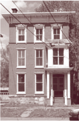
217 RUTGER STREET Italianate style, circa 1869

They are living symbols of the city's proud past and are about to become catalysts in her exciting future.