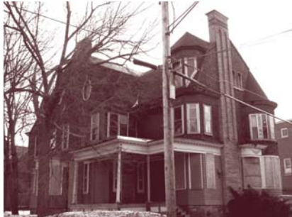
1001 MILLER STREET Shingle style, circa 1885