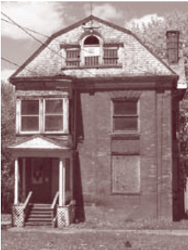
223 RUTGER STREET Queen Anne style, circa 1880