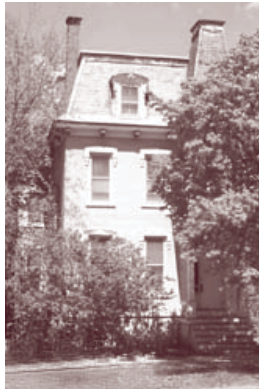
219 RUTGER STREET Second Empire style, circa 1860