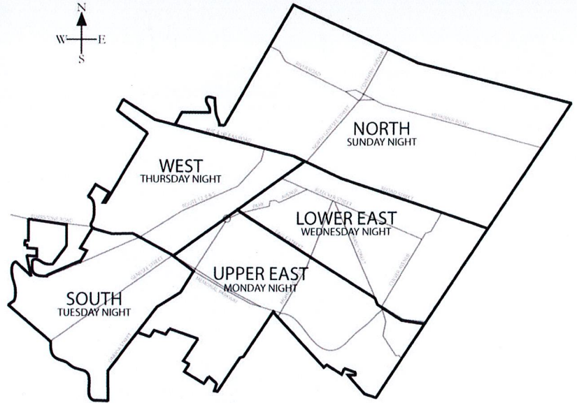
CITY OF UTICA GREEN WASTE COLLECTION ROUTES

Dates subject to change due to weather at the DPW Commissioner's discretion. Your FINAL PICK-UP is the last day to put out bulk green waste. Heavy volume of green waste in certain areas of the city may cause delays. Please be patient with crews.